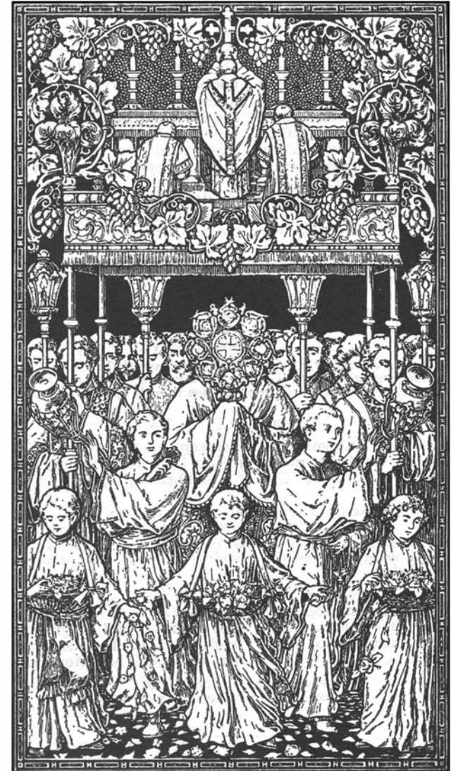
The Most Holy Sacrament